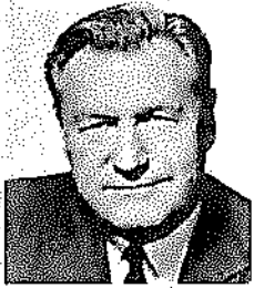
Nelson A. Rockefeller, Governor