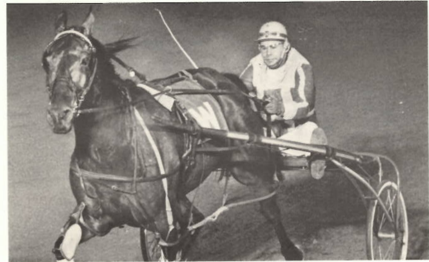
The ageless Cardigan Bay (Stanley Dancer), Harness Racings only millionaire horse shown building up his huge winnings at the Westchester Oval.

A spectacular $2,240,400 was distributed in 48 stakes and features which included both Triple Crown events that carried $150,000 purses....the Yonkers Futurity Trot and Cane Futurity Pace. Also, the Empire Pace and Hilltop Trot, each carrying a $100,000 prize, the $150,000 International Pacing Series and a world record of $619,200 disbursed in ten New York Sires Stakes matches, enhanced the campaign.