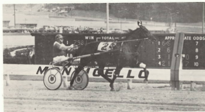
Song Cycle is all by himself as he takes the $15,000 Catskills Free-For-All Pace at the Mighty M for Billy Shuter in 1:59 1/5. The mile was one of three in 2:00 or less authored in 1968, a new track record for age, gait and sex, and the second fastest ever at the mountain oval.

Following the closing in September, Greenberg gave orders for the construction of a new, two-story, motel-style grooms' quarters, enclosure of the grandstand with retractable windows, renovation of the Ichabod Crane Terrace, main cafeteria and a general all around face-lifting.